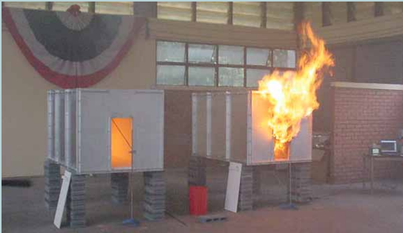
Reduced Scale Box Test [ISO17431]